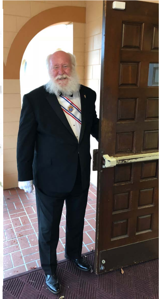
"Our Season's Greeter"

May the Blessings of Christ Be Yours this Christmas